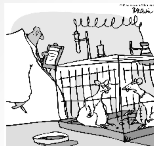
"At first it's, we'll try this and we'll try that. But when there's a medical breakthrough, guess who takes all the credit."

Livestock trials produced such outstanding results, it initiated what was to become an extensive 25 year search for evidence that humans might also benefit from such a simple addition to dietary intake.